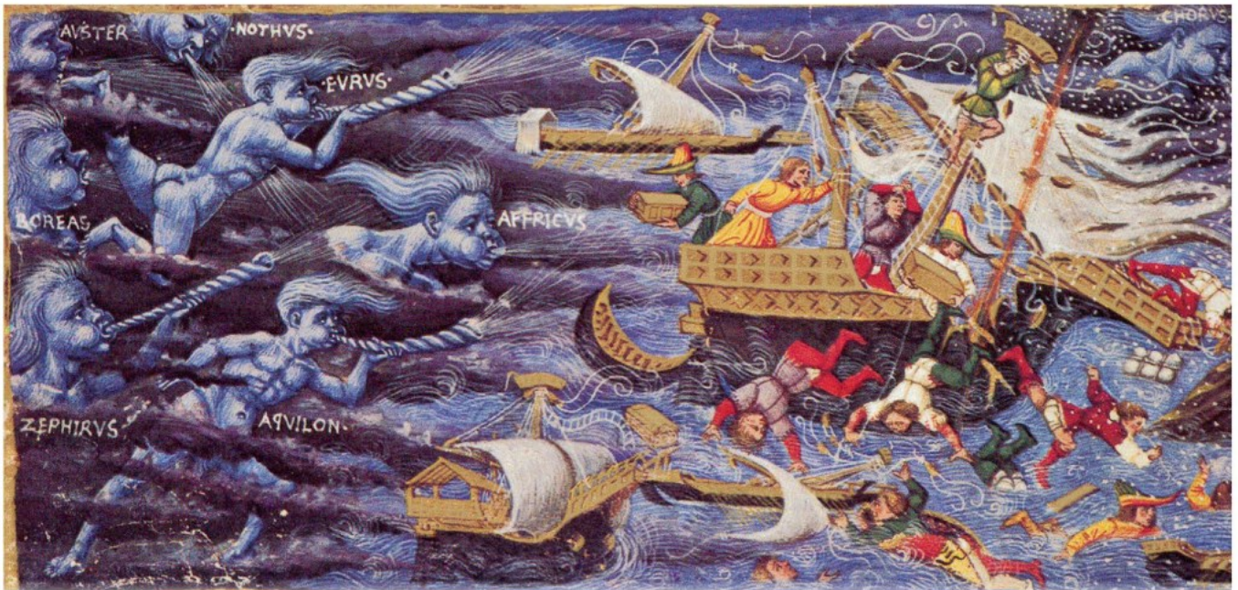
(Apollonio di Giovanni (1415-1465), "Rari Nantes in Gurgite Vasto", miniatura. Firenze, Biblioteca Ricciardiana)

"Primum vivere, deinde philosophari", (First live, then philosophize)" said the ancient Romans.