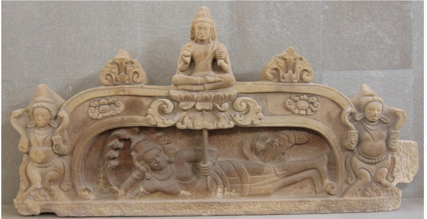
Nārāyaṇa tiene nella mano sinistra un gambo di loto che scaturisce dal suo ombelico e sul fiore di cui è intronizzato Brahma. Rilievo Cham, Vietnam (c.700 d.C.)

Nārāyaṇa is, for Hindus, one of the many manifestations of Vishnu: the one who presides over the cosmic night just as Shiva is the lord of the manifest universe. He symbolizes the state of latency that precedes the beginning of each era and that will inevitably follow its end.